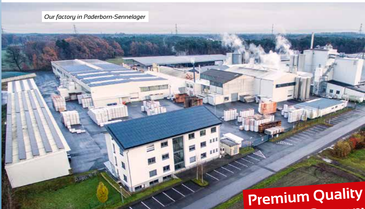
Our factory in Paderborn-Sennelager

redstone is an innovative manufacturer of an efficient range of products used for mould and moisture remedy, as well as enhanced comfort in the home and the use of interior insulation in energy-efficient renovations. The systems are supplemented and optimised with mineral and environmentally friendly wall coatings.